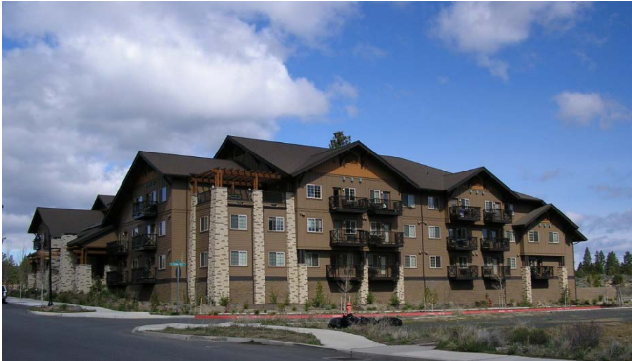
Discovery Park Lodge – 53 senior housing units at 60% AMI