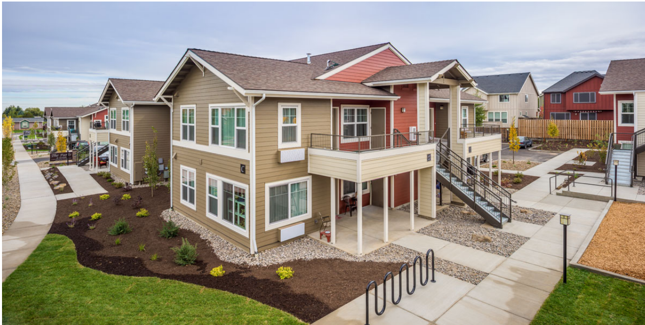
The Parks at East Lake – 40 units at 60% AMI

Fee to address lack of workforce housing, low vacancy rates and increase in home prices