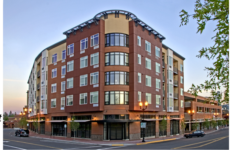
Putnam Pointe – 44 units at or below 60% AMI